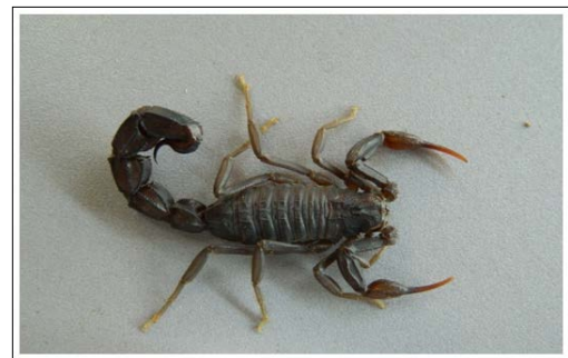
Figure 2: Photograph of the Androctonus Turkiyensis Yağmur scorpion

Permission for the study was provided by the Ministry of Agriculture and Forestry, General Directorate of Nature Conservation and National Parks, Turkish Republic (Protocol No: E-21264211-288.04-3886212). In the study, one scorpion obtained from Şanlıurfa, Turkey was used.